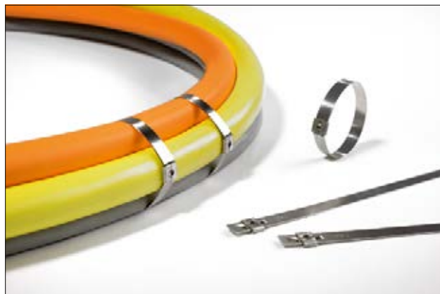
Stainless Steel Cable Ties MST-Series.