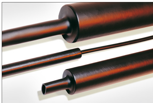
MA47 and MU47 medium wall tubing - lined and unlined.