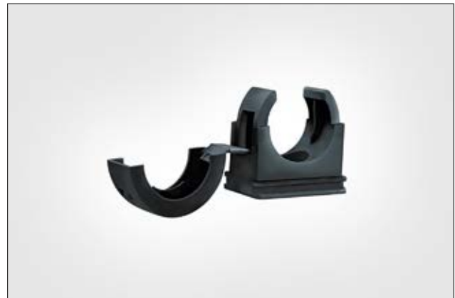
HelaGuard PACC Conduit Clip.