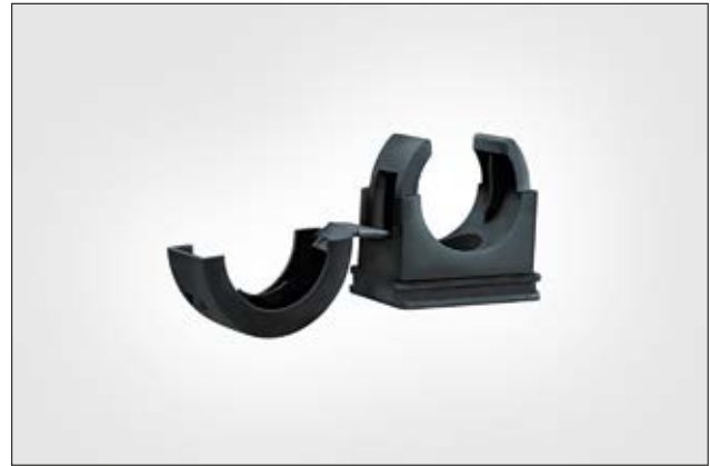
HelaGuard PACC Conduit Clip.