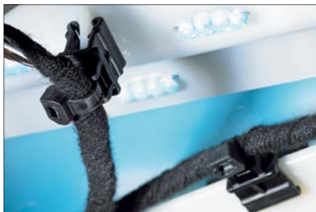
T50ROSEC10 fitted onto a plastic panel to hold a Ø 6 mm harness.