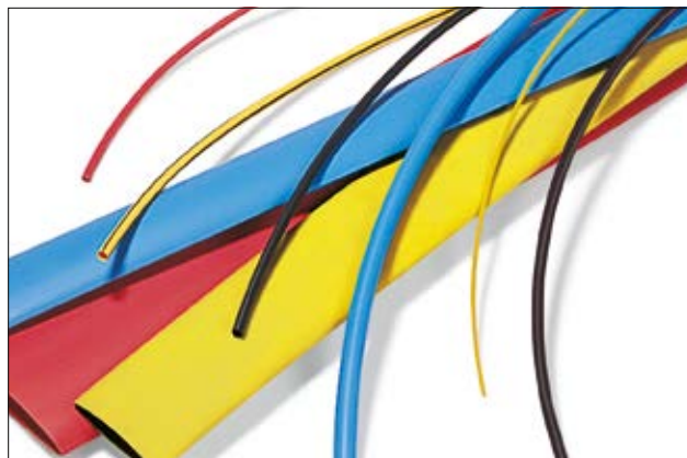
TF21 – available in a wide range of colours and sizes.