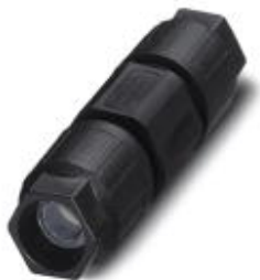
QUICKON conductor connector, 4-pos., connection cross section 0.34-0.75 mm 2 , customer version

Please be informed that the data shown in this PDF Document is generated from our Online Catalog. Please find the complete data in the user's documentation. Our General Terms of Use for Downloads are valid ( http://phoenixcontact.com/download )