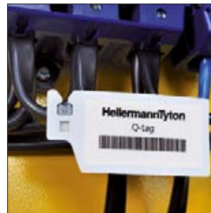
Q-tags can be labelled with pre-printed labels or by hand.