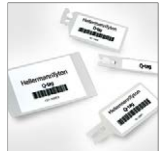
Q-tags are available in different sizes and types.