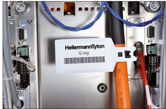
The flagged orientation of Q-tags ensures that printed texts are easily visible.

Please find the corresponding labels on page 463.