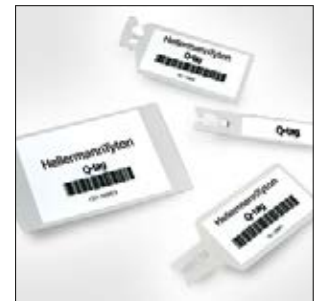
Q-tags are available in different sizes and types.