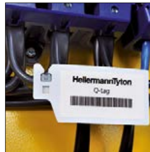
Q-tags can be labelled with pre-printed labels or by hand.