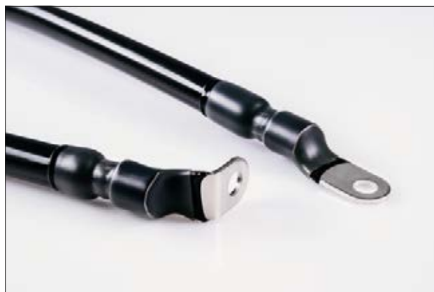
Heat shrink tubing SA47-LA for cable connection.

Cut lengths available on request. Please contact us!