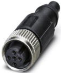
PROFIBUS M12 termination resistor, female connector version

Please be informed that the data shown in this PDF Document is generated from our Online Catalog. Please find the complete data in the user's documentation. Our General Terms of Use for Downloads are valid ( http://phoenixcontact.com/download )