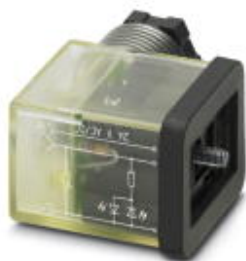
Valve connector, 3-pos., construction B, 1 LED, with protective circuit, screw connection, M16 cable gland

Please be informed that the data shown in this PDF Document is generated from our Online Catalog. Please find the complete data in the user's documentation. Our General Terms of Use for Downloads are valid ( http://phoenixcontact.com/download )