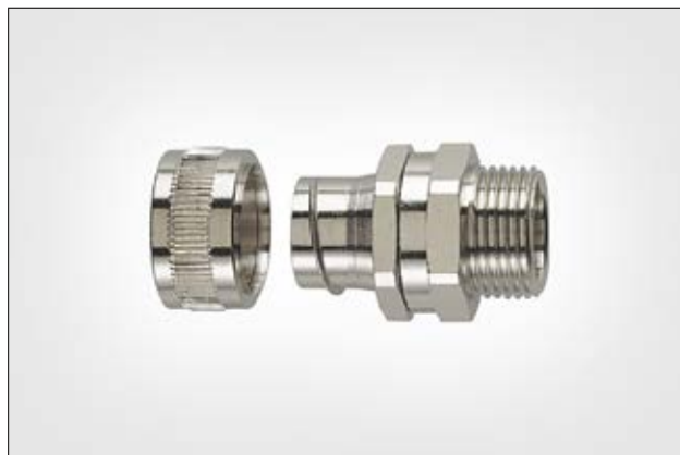
HeloGuard SC-SM Swivel External Thread.