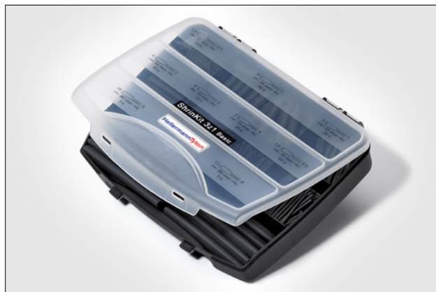
ShrinkKit 321 Basic.