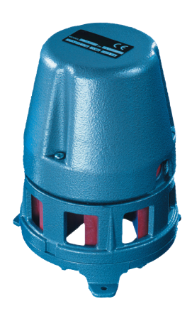
Applications - Fire alarm; security alarm; general safety warning; conveyors; process control alarm; vehicle alarm