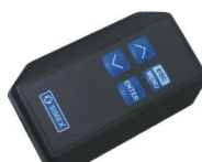
IR remote controller SIR-15