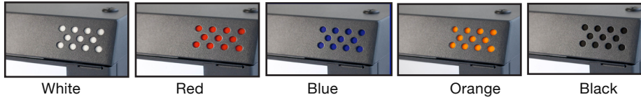
White Red Blue Orange Black