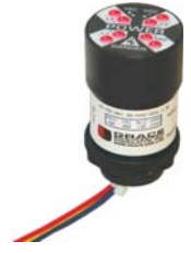
Part Number: R-3W / R-3W-SR

Part numbers include: R-3W, R-3W2, R-3W-SR, R-3F, R-1VH003 and R-1VL003