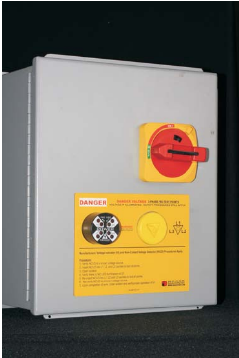
Part Number: R-T3W-LCH

Permanent Electrical Safety Devices (PESDs) are defined as external devices (except Medium Voltage Indicators, which are internal) permanently mounted to electrical systems that, directly or indirectly, reduce the risk of arc flash and/or shock hazard. They provide feedback on the voltage state within the enclosure and eliminate proximate exposure to that same voltage. Some examples of PESDs include voltage portals and voltage indicators.