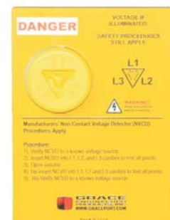
R-T3 voltage portal with label (sold separately)