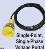
Single-Point, Single-Phase Voltage Portal