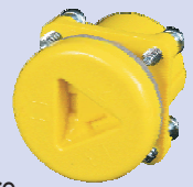
Single-Point, Three-Phase Voltage Portal