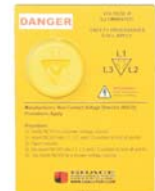
Part Number: R-T3 with label (label sold separately)

Part numbers include: R-1A003-LPH and R-T3