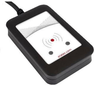
Desktop version (inlay customizable)

Elatec's TWN4 family of transponder readers and writers allows users to read and write to almost any 125 kHz, 134.2 kHz and 13.56 MHz tags and/or labels. It supports all major transponders from various suppliers like ATMEL, EM, ST, NXP, TI, HID etc. and ISO standards like ISO14443A/B (T=CL), ISO15693, ISO18092 / ECMA-340 (NFC).