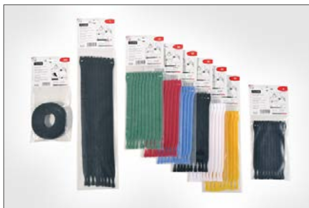
The TEXTIE-Series is available in different colours and lengths.