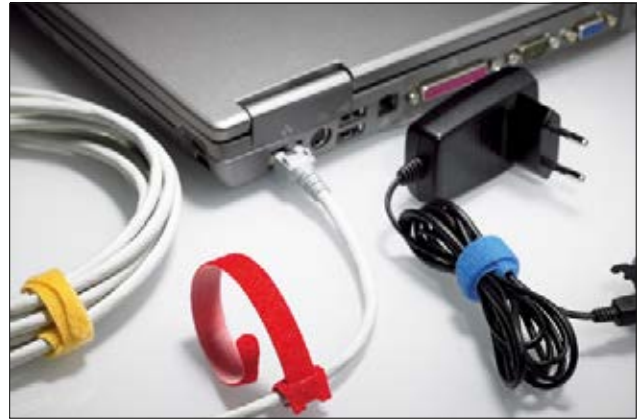
Due to the functional cable tie design the TEXTIE is fixed on the cable and can't get lost.