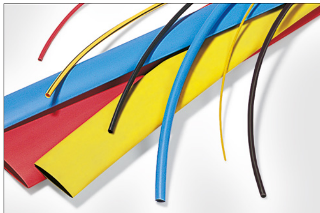
TF21 – available in a wide range of colours and sizes.