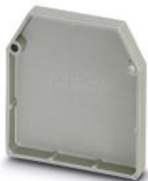
Separating plate, Length: 50 mm, Width: 7.5 mm, Height: 52 mm, Color: gray

Please be informed that the data shown in this PDF Document is generated from our Online Catalog. Please find the complete data in the user's documentation. Our General Terms of Use for Downloads are valid ( http://phoenixcontact.com/download )