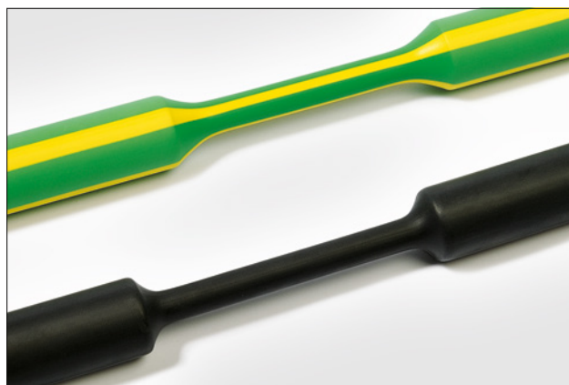
TREDUX shrinks a maximum of 3:1.