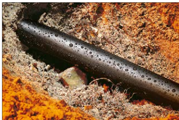
TREDUX HA47 - application below ground.