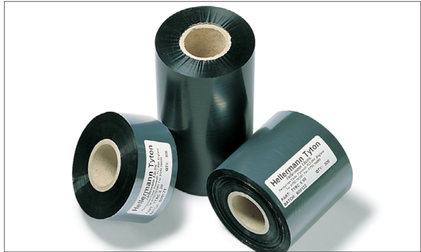
Ribbons - TTRA, TTRC+.

The range of ribbons has been designed to give maximum print clarity and performance. Material can be handled immediately after printing, enabling the printed tubing to be immediately applied without a secondary mark stabilising operation.