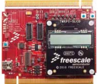
Figure 2: Front Side of TWR-K40X256 Module with TWRPI-SLCD Attached.