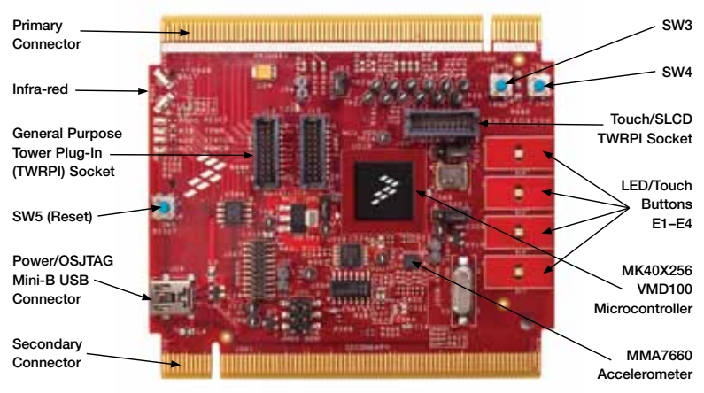
Figure 1: Front Side of TWR-K40X256 Module Not Including TWRPI.