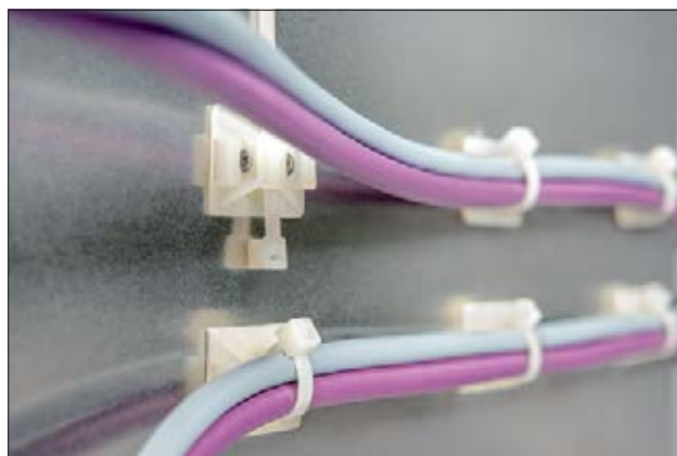
TY-Series mounts with rectangle design / screwable, self adhesive.