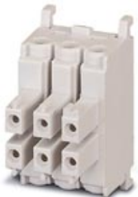
Contact insert module, for sleeve frames, with screw connection, 6-pos., 250 V / 10 A

Please be informed that the data shown in this PDF Document is generated from our Online Catalog. Please find the complete data in the user's documentation. Our General Terms of Use for Downloads are valid ( http://phoenixcontact.com/download )