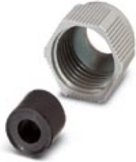
D-SUB cap nut with line seal, for sleeve housing VS-09-..., conductor diameter of 3 mm ... 6 mm

Please be informed that the data shown in this PDF Document is generated from our Online Catalog. Please find the complete data in the user's documentation. Our General Terms of Use for Downloads are valid ( http://phoenixcontact.com/download )