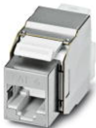
RJ45 socket insert, modular (Keystone), CAT6, 8-pos., shielded, with cable connection (LSA), for litz and solid wires AWG 26 ... 22

Please be informed that the data shown in this PDF Document is generated from our Online Catalog. Please find the complete data in the user's documentation. Our General Terms of Use for Downloads are valid ( http://phoenixcontact.com/download )