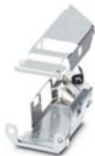
D-SUB EMC inner sleeve, for sleeve housing VS-09-..., shell size 1, shielded

Please be informed that the data shown in this PDF Document is generated from our Online Catalog. Please find the complete data in the user's documentation. Our General Terms of Use for Downloads are valid ( http://phoenixcontact.com/download )