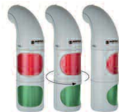
The direction of the optical signal can be individually adjusted