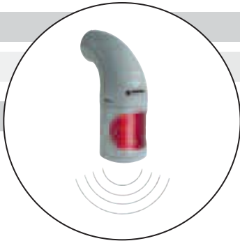
High visibility LED Traffic Light with integrated siren see page 181