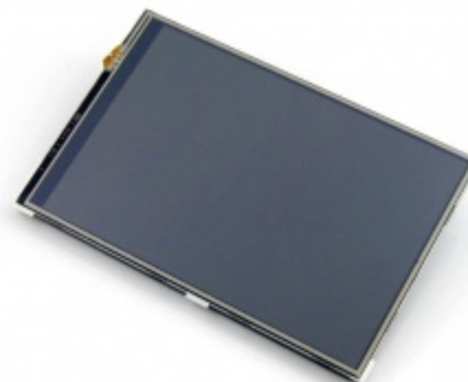
4inch RPi LCD (A) 320×480, IPS

4 inch Touch Screen TFT LCD Designed for Raspberry Pi