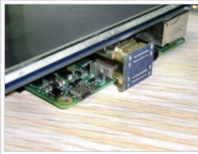
Plug the HDMI Connector

Note: This product can only work on a Raspberry Pi but not work on a PC. That is, if the HDMI of the LCD is connected to the HDMI on a PC, the LCD doesn't display anything.