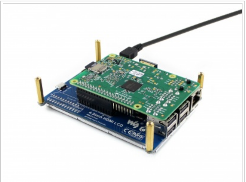
Hardware connection for Raspberry Pi Model A+/B+/2 B/3 B

3. Turn on the "backlight" switch on the back of the LCD.