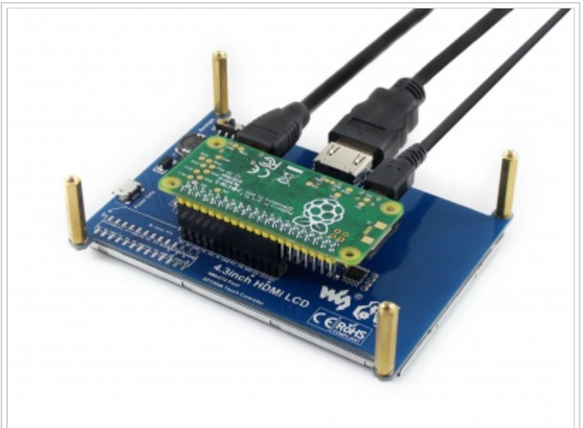
Hardware connection for Raspberry Pi Zero

1) Download the Raspbian / Ubuntu Mate image from Raspberry Pi website ( https://www.raspberrypi.org/downloads/ ) and extract it on a PC.