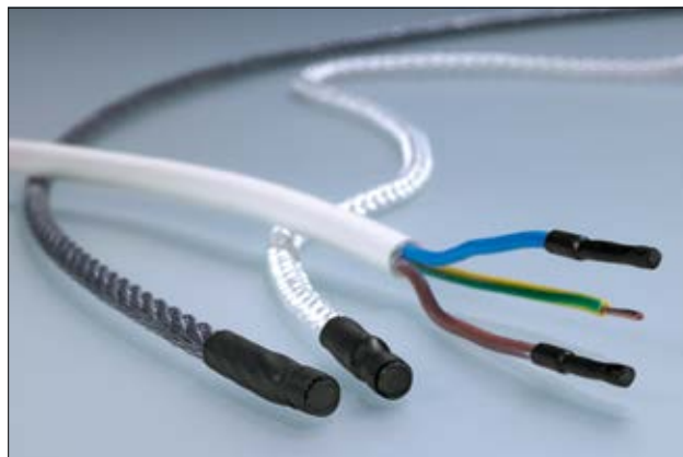
The appropriate end cap for every cable diameter, and cable types.