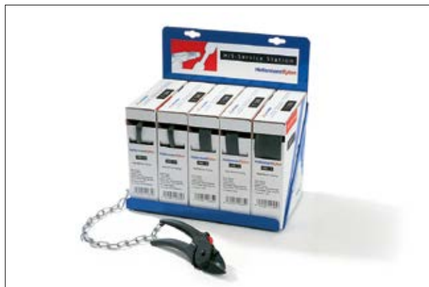
HIS-Service Station contains 5 dispensers and a special cutter.