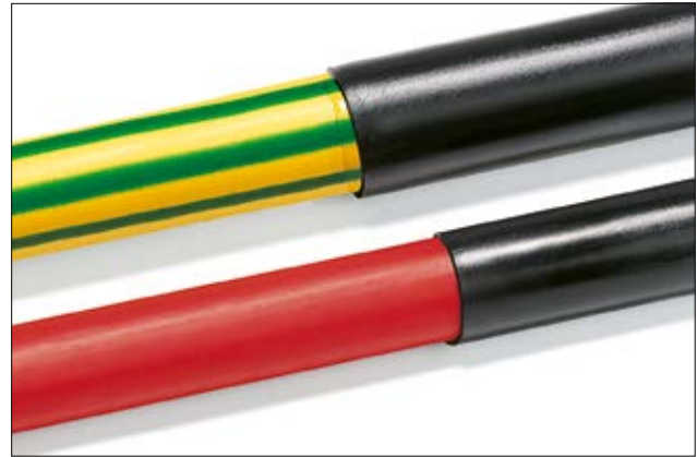
TA32 and TA42 are UL224 listed adhesive lined tubing. Available in 3:1 and 4:1 shrink ratio.