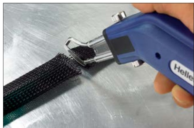
The HSGO hot cutting tool prevents the braided sleeving from fraying.

A replacement blade is available with the item number 170-99002.