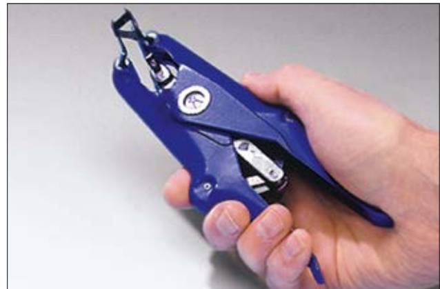
Fast, secure application with the three-pronged expansion tools.