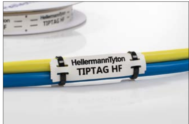
TIPTAG - High performance cable bundle marking.