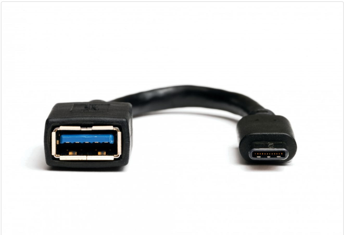
TA285 USB Type-C to Type-A adaptor

Type-C does not define a communication or protocol standard. It is purely a physical cable/connector standard.