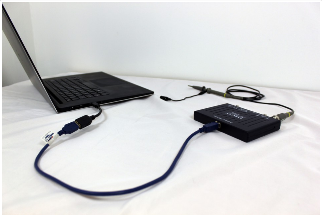
PicoScope 2208B connected to USB Type-C