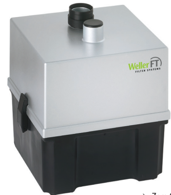
> Zero Smog 2 unit