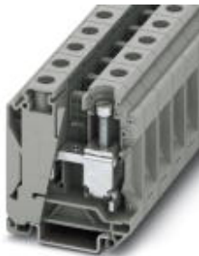
Feed-through terminal block, Connection method: Screw connection, Cross section: 10 mm 2 - 35 mm 2 , AWG: 8 - 2, Width: 16 mm, Color: blue, Mounting type: NS 35/7,5, NS 35/15

Please be informed that the data shown in this PDF Document is generated from our Online Catalog. Please find the complete data in the user's documentation. Our General Terms of Use for Downloads are valid ( http://phoenixcontact.com/download )