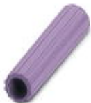
Insulating sleeve, Color: violet