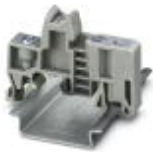
End clamp, Width: 9.5 mm, Height: 35.3 mm, Length: 50.5 mm, Color: gray