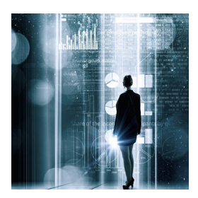
From Hewlett-Packard to Agilent to Keysight