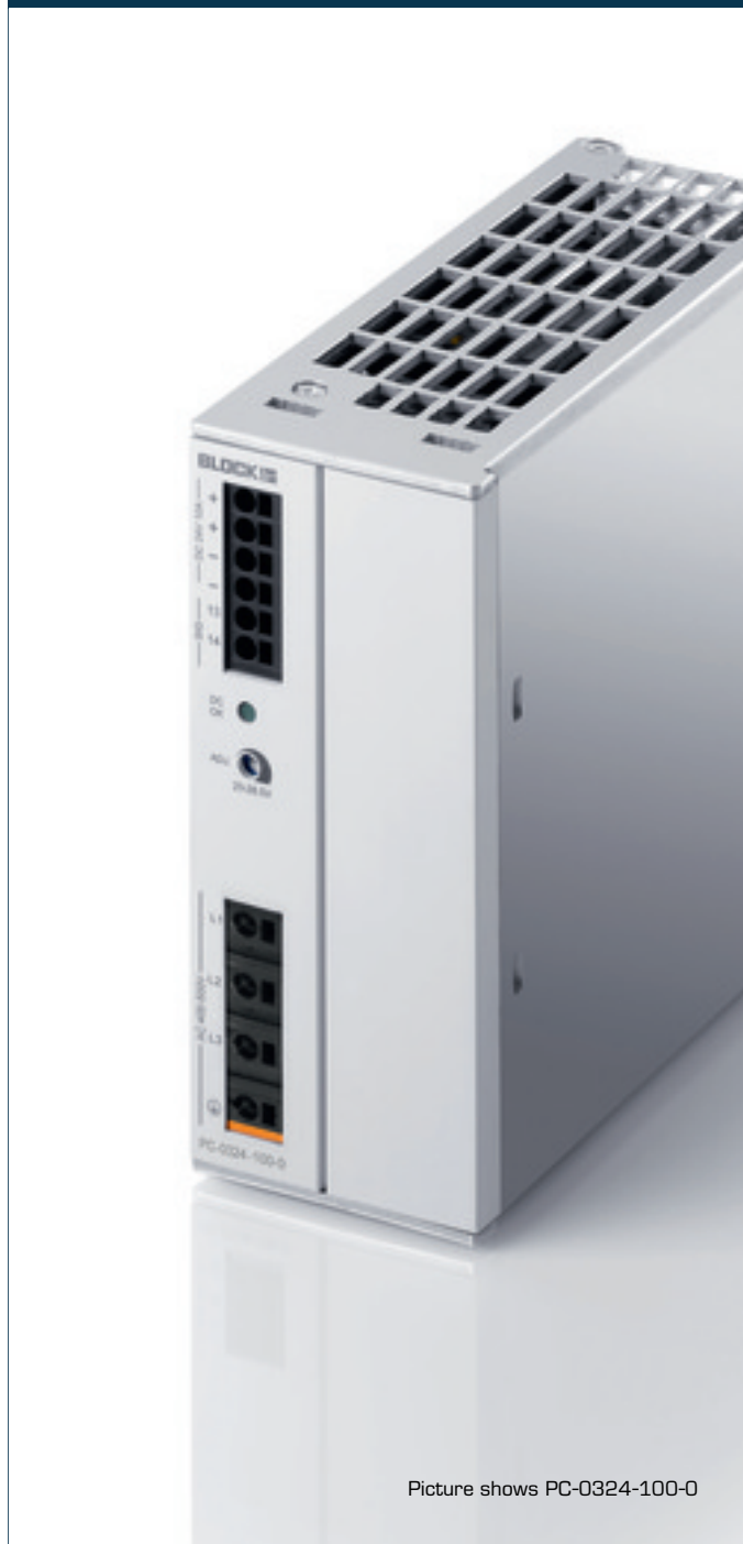
Picture shows PC-0324-100-0