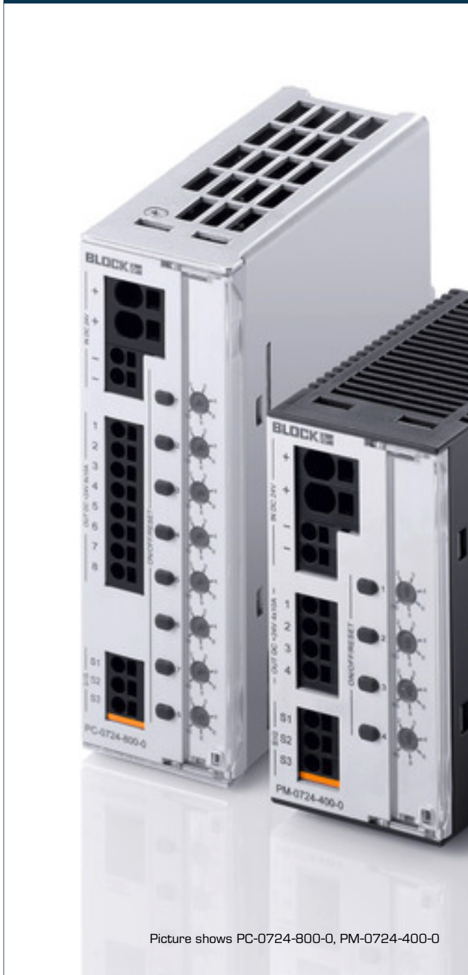
Picture shows PC-0724-800-0, PM-0724-400-0