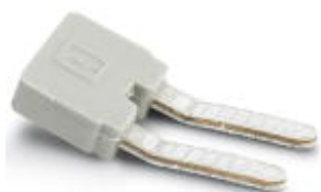
The figure shows the 2-position version

Insertion bridge, fully insulated, for connectors with 5.0 or 5.08 mm pitch, no. of positions: 6