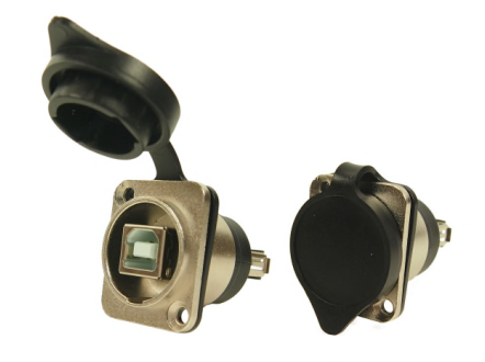
Part No. CP30112